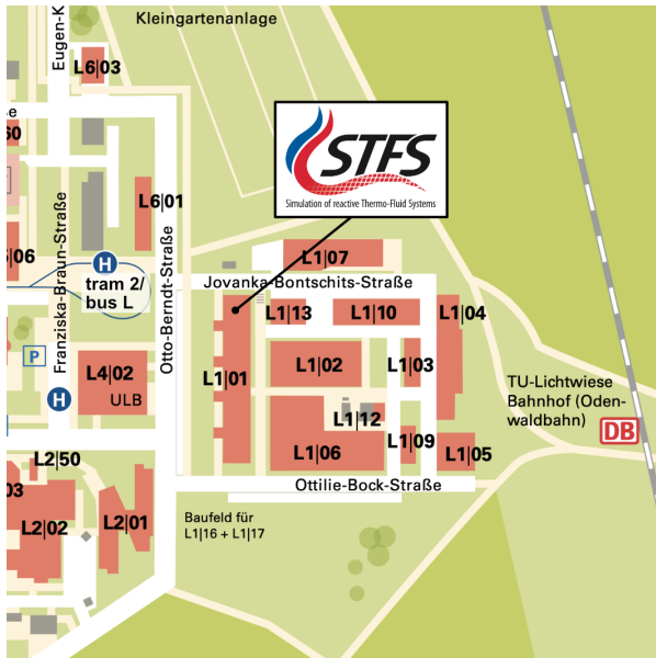
Map of the Lichtwiese campus at TU Darmstadt

For further information after your arrival, ask at the office ( Room L1|01-283 )